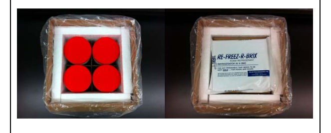
Figure 4: Packing 4 canisters containing specimen containers and freezer bricks.