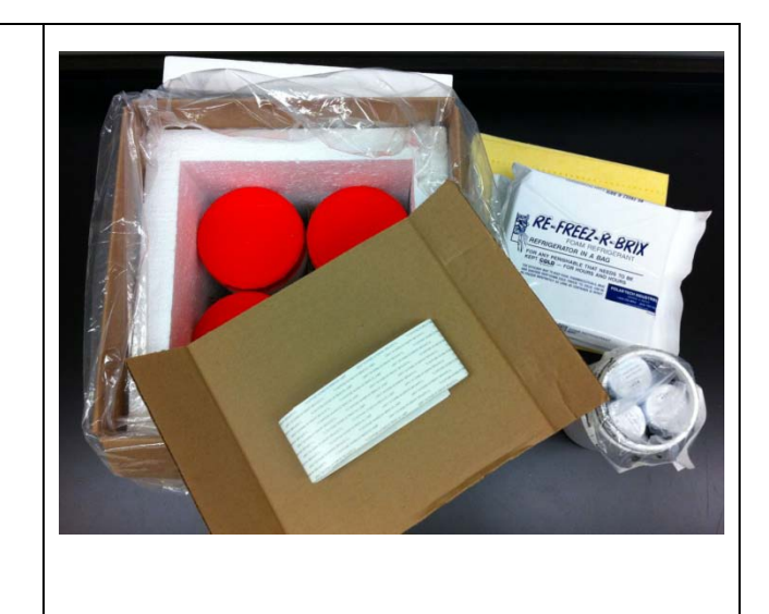
Figure 1: Contents of Aqua kit All canisters, including empty ones, should be packed in the aqua kit.

OP-0001-W3 VER. 03.08 Effective Date: mm/dd/yyyy Page 3 of 6